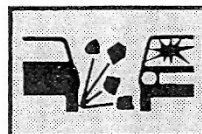
Loose stones on roadway. Danger of windscreen damage - slow down, exercise caution.