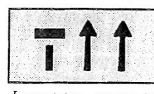
Lane status - prepare to merge, left lane closed, right lanes open