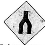
End Divided Road