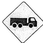
Trucks (crossing or entering)