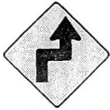
Sharp Successive bends

Circle or tick them when you find them and don't forget to ask an adult to explain any you don't understand.