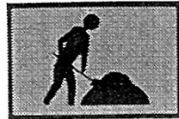
Workers ahead - Slow Lane