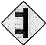
Successive Side Road Junctions