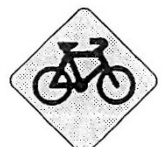
Bicycles crossing the road